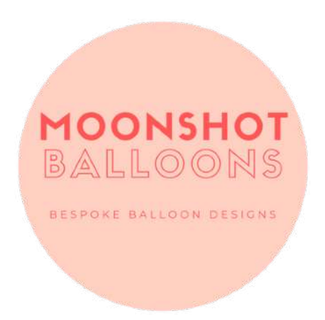
Moonshot Balloons @moonshotballoons