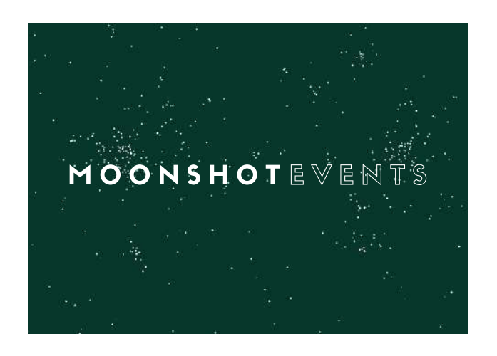
Moonshot Events @moonshot_events