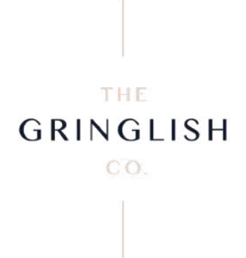
The Gringlish Co Catering @gringlish.co