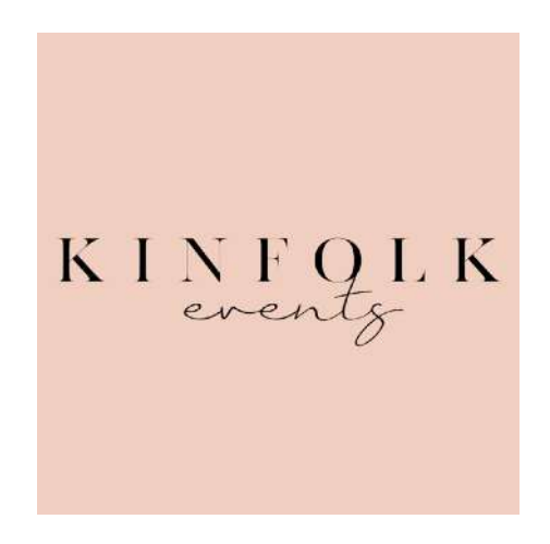
Kinfolk Event Planners @kinfolk events

We also have a list of photographers if you would like to have your big day captured. As with all other external providers, we are happy to work with whoever you choose.